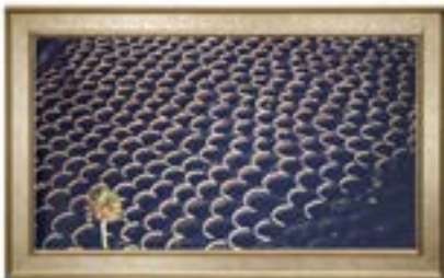
EVEREST LIGHT GOLD