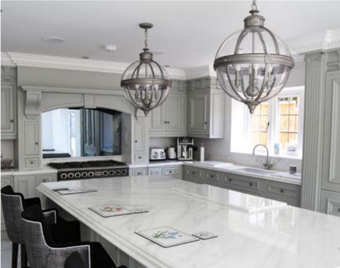
SPLASHBACK MIRROR TV HEAT RESISTANT