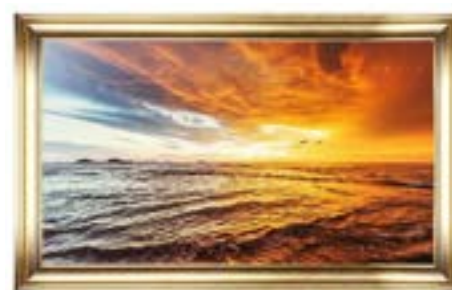
SYDNEY BLACK WITH GOLD TRIM