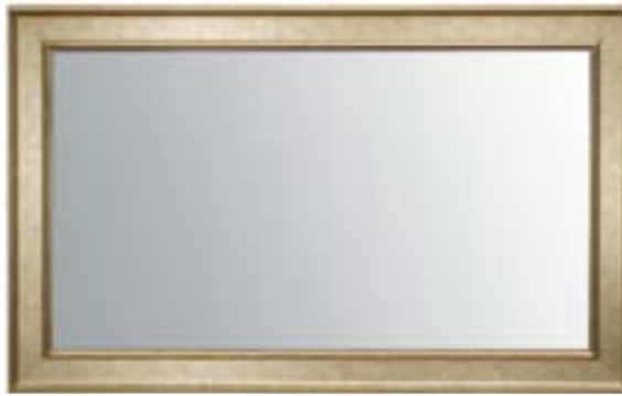
EVEREST LIGHT GOLD

Dimensions: 70mm Face width. Click for more info