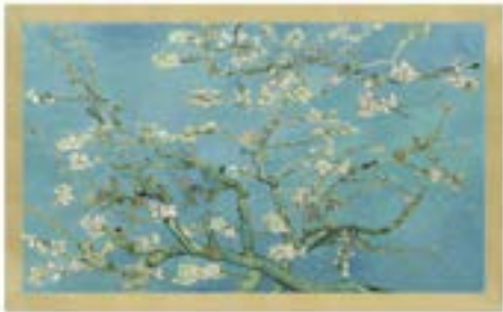
ART DECO NATURAL OAK VANEER