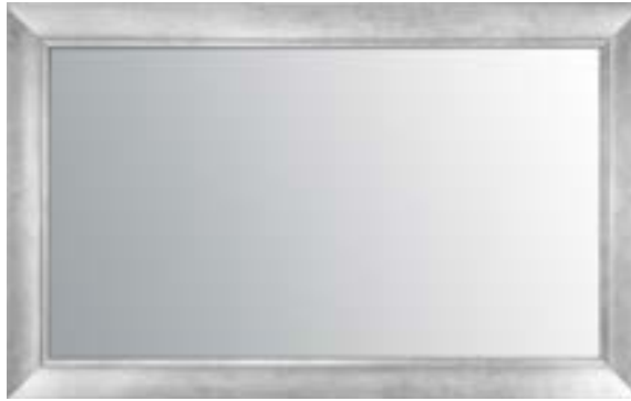
NEW YORK SILVER

Dimensions: 70mm Face width. Click for more info