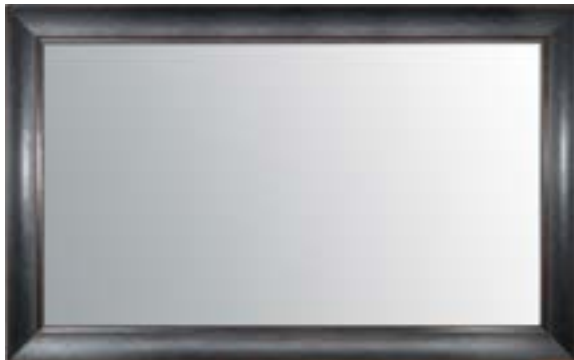
NEW YORK BLACK

Dimensions: 70mm Face width. Click for more info