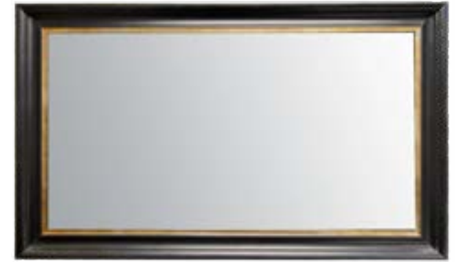
WARWICK BLACK GOLD

Dimensions: Natural depth 45mm Width 74mm Click for more info