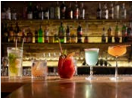
CLUBS AND BARS