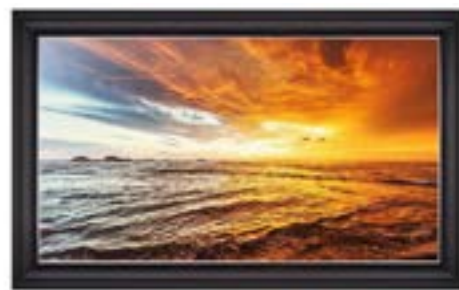
SYDNEY BLACK WITH GOLD TRIM