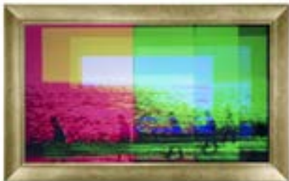
NEW YORK GOLD