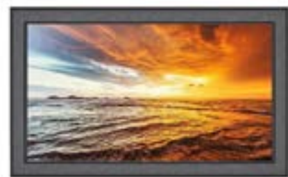
EVEREST BLACK AND ORANGE