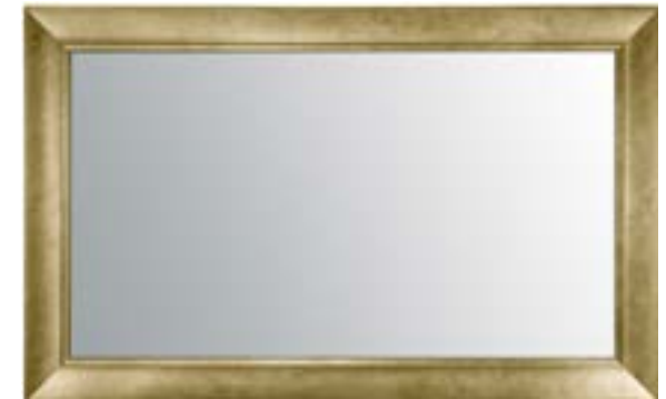
NEW YORK GOLD

Dimensions: 70mm Face width. Click for more info