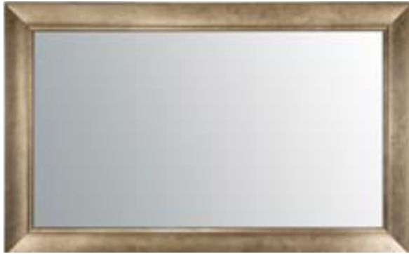
NEW YORK BRONZE

Dimensions: 70mm Face width. Click for more info