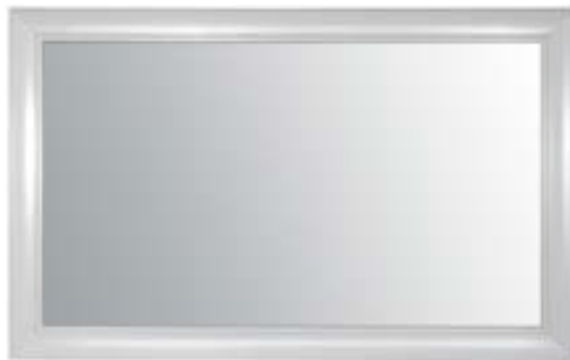
NEW YORK WHITE

Dimensions: 70mm Face width. Click for more info