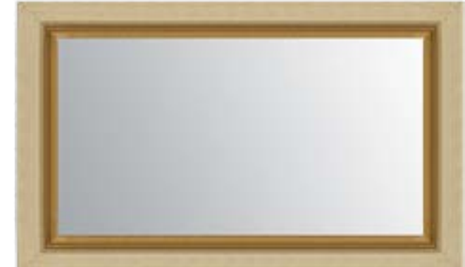
SENELAR IVORY GOLD

Dimensions: Also available in Slim 62mm Click for more info