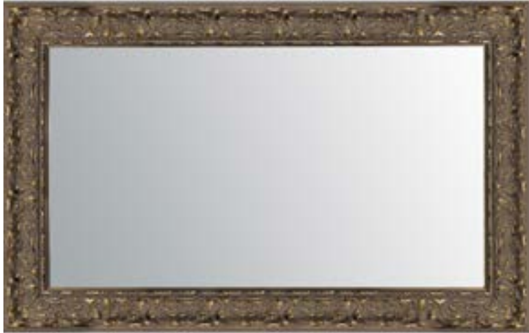
PRAGUE BROWN GOLD