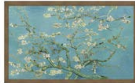
ART DECO WALNUT OAK VANEER