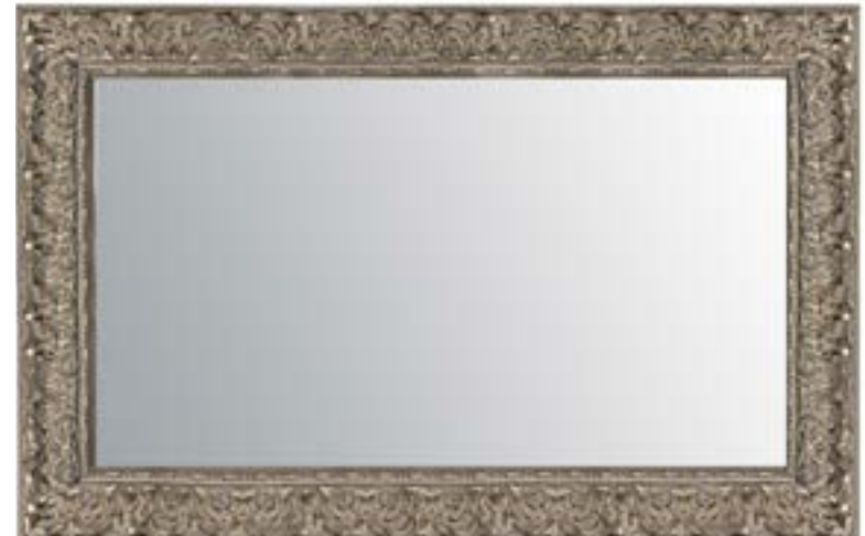
PRAGUE GREY SILVER