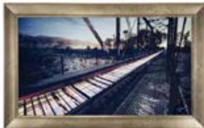
NEW YORK BRONZE