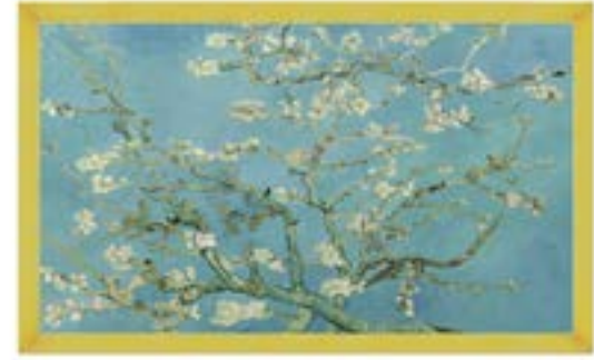
ART DECO GOLD