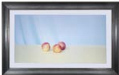
NEW YORK BLACK AND ORANGE