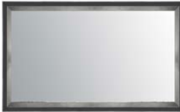
SOHO BLACK SILVER

Dimensions: 52mm Face width. Click for more info