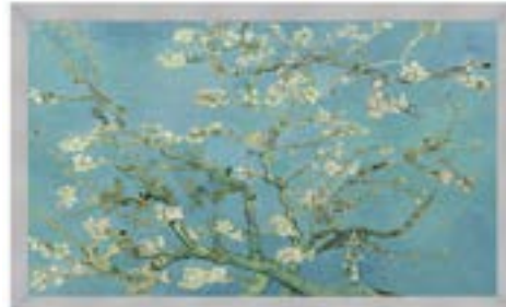
ART DECO SILVER