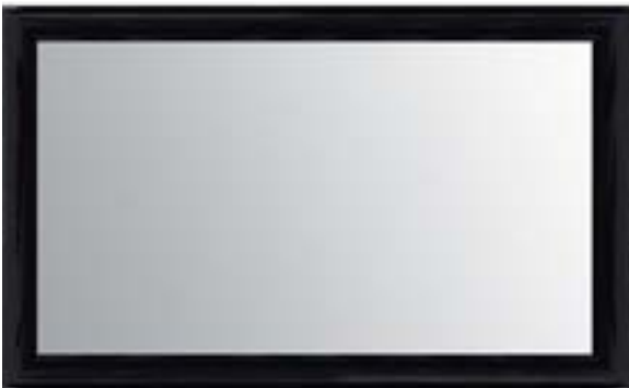
THE DOME BLACK

Dimensions: 52mm Face width. Click for more info