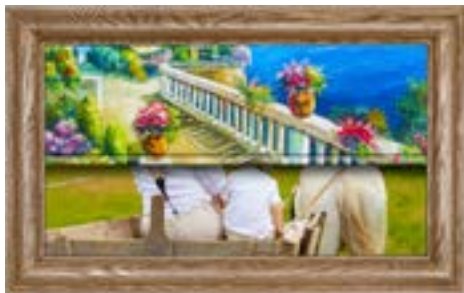
THE LA CLASSICO

Elevate your living space with our Motorised Artwork TV Frames. Perfectly combining technology and aesthetics, these frames display your chosen artwork when your TV is off, transforming it into a stunning centerpiece. With just a press of a button, the canvas rolls back to reveal your TV, offering a seamless blend of functionality and style.