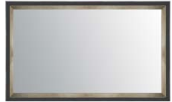
SOHO BLACK GOLD

Dimensions: 52mm Face width. Click for more info