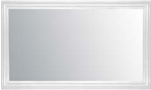
WARWICK WHITE GOLD

Dimensions: Natural depth 45mm Width 74mm Click for more info