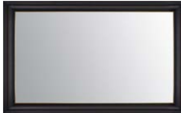
SYDNEY BLACK INNER SILVER