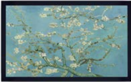
ART DECO BLACK