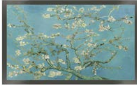
ART DECO CHARCOAL