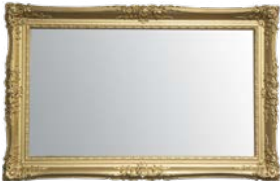
THE DOUBLE SWEPT

Dimensions: 135mm Face width. Click for more info