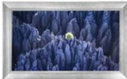
NEW YORK SILVER