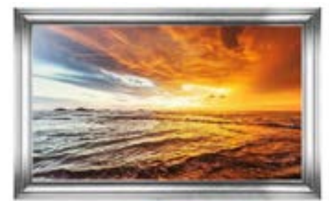
SYDNEY BLACK WITH GOLD TRIM