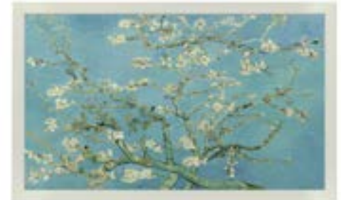
ART DECO WHITE